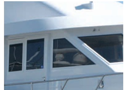
MULTIPLE MARINE USES