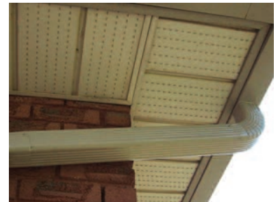
GUTTERS AND DOWNSPOUTS