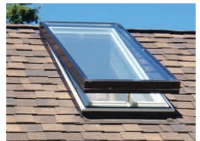
ROOFING AND SKYLIGHTS